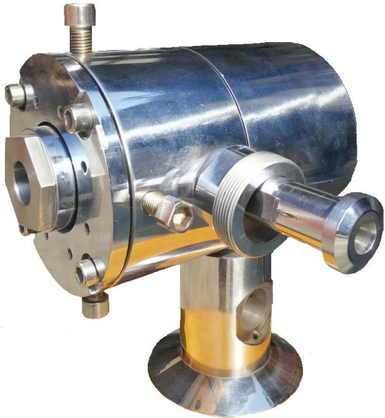
FOAM/SKIN CROSSHEAD 2.0 – 13.0 MM